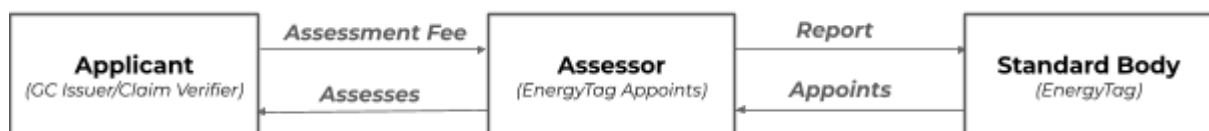
Figure 2 – EnergyTag Accreditation Roles

Figure 2 provides an overview of the key roles in the Assessment process: